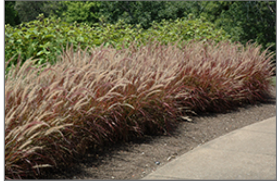
Purple Fountain Grass in bloom

Purple Fountain Grass will grow to be about 4 feet tall at maturity, with a spread of 3 feet. Although it's not a true annual, this plant can be expected to behave as an annual in our climate if left outdoors over the winter, usually needing replacement the following year. As such, gardeners should take into consideration that it will perform differently than it would in its native habitat.