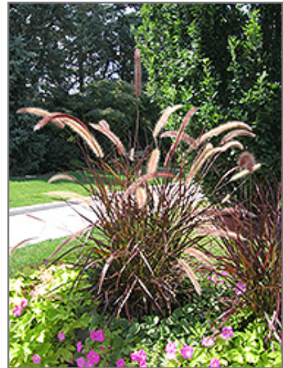
Purple Fountain Grass flowers

Purple Fountain Grass is recommended for the following landscape applications;