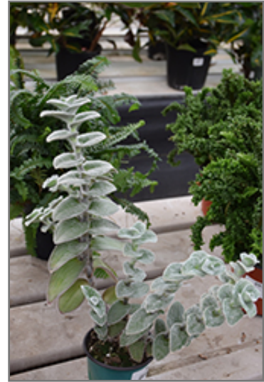
Cobweb Spiderwort in full

This is an herbaceous evergreen houseplant with an upright spreading habit of growth. Its relatively fine texture sets it apart from other indoor plants with less refined foliage. This plant may benefit from an occasional pruning to look its best.