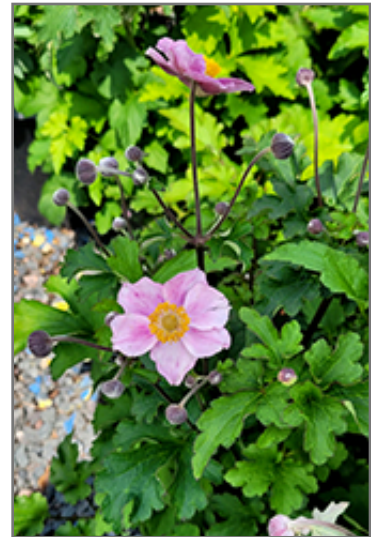
Pink Saucer Anemone flowers

Pink Saucer Anemone is recommended for the following landscape applications;