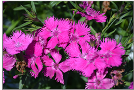
Rockin' Purple Pinks flowers

This is a relatively low maintenance plant, and is best cleaned up in early spring before it resumes active growth for the season. It is a good choice for attracting bees and butterflies to your yard, but is not particularly attractive to deer who tend to leave it alone in favor of tastier treats. It has no significant negative characteristics.