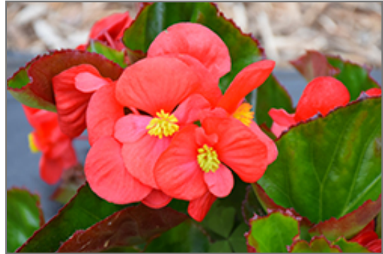
Big Red Green Leaf Begonia flowers