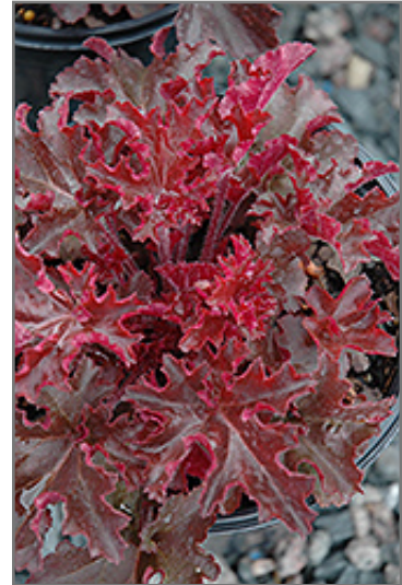
Melting Fire Coral Bells foliage

Melting Fire Coral Bells is recommended for the following landscape applications;