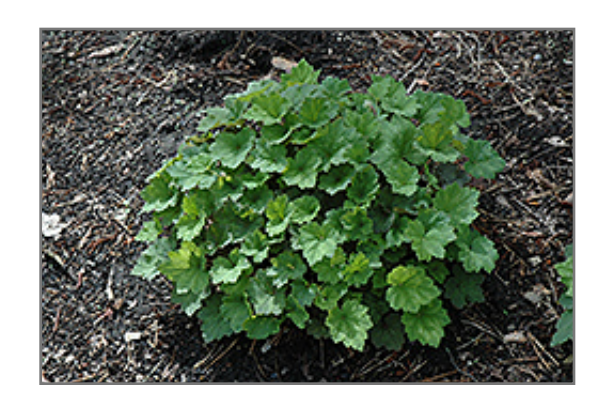
Forest Frost Fringecups