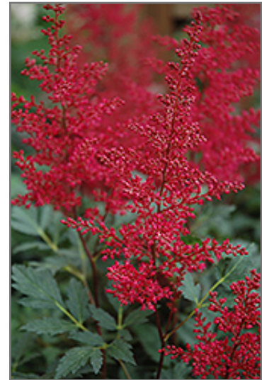
Red Sentinel Astilbe flowers

Red Sentinel Astilbe is recommended for the following landscape applications;