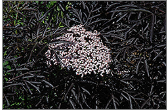
Black Lace Elder flowers