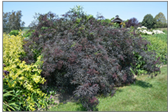
Black Lace Elder