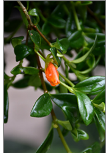
Goldfish Plant flowers

This is a dense herbaceous evergreen houseplant with a trailing habit of growth, eventually spilling over the edges of hanging baskets and containers. This plant can be pruned at any time to keep it looking its best.