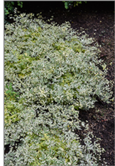
Golden Feathers Jacob's Ladder foliage

Golden Feathers Jacob's Ladder is recommended for the following landscape applications;