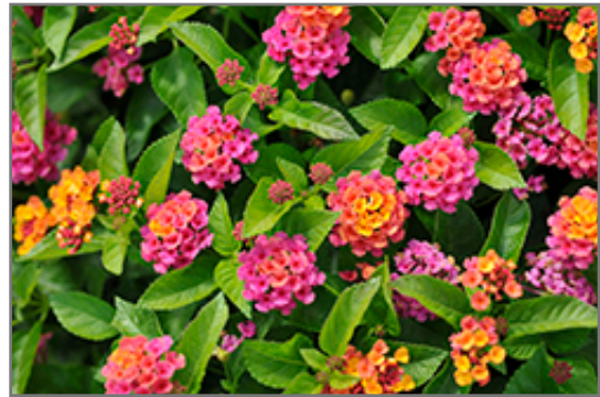
Bloomify Rose Lantana flowers

Bloomify Rose Lantana is recommended for the following landscape applications;