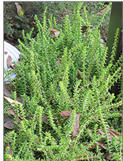
Watch Chain Crassula