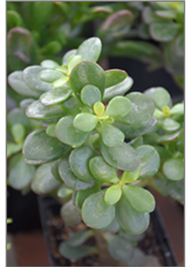
Baby Jade Plant foliage

This is a multi-stemmed evergreen houseplant with an upright spreading habit of growth. This plant can be pruned at any time to keep it looking its best.