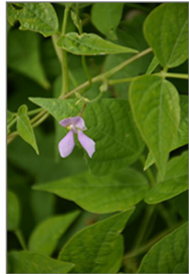
Golden Wax Bean flowers

Golden Wax Bean will grow to be about 10 feet tall at maturity, with a spread of 24 inches. When planted in rows, individual plants should be spaced approximately 12 inches apart. Because of its vigorous growth habit, it may require staking or supplemental support. This fast-growing vegetable plant is an annual, which means that it will grow for one season in your garden and then die after producing a crop. Because of its relatively short time to maturity, it lends itself to a series of successive plantings each staggered by a week or two; this will prolong the effective harvest period.