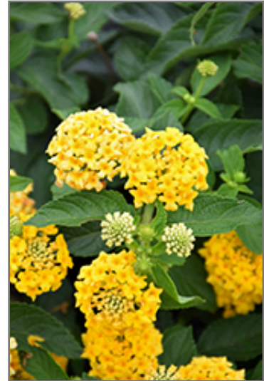
Landscape Bandana Yellow Lantana flowers

Landscape Bandana Yellow Lantana is recommended for the following landscape applications;