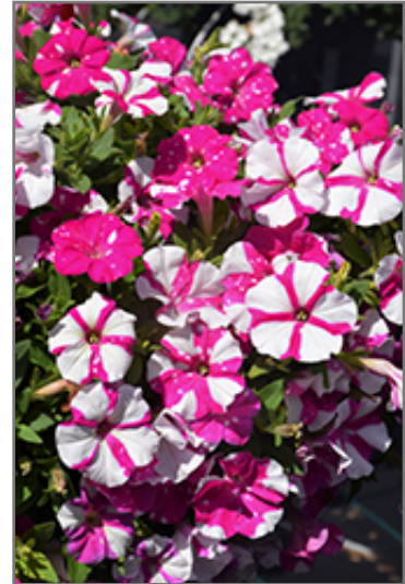
Headliner Pink Sky Petunia flowers

Headliner Pink Sky Petunia is recommended for the following landscape applications;