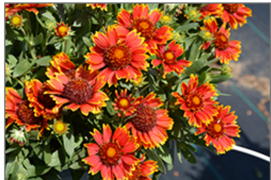
SpinTop Orange Halo Blanket Flower flowers