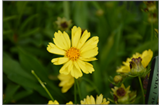
Leading Lady Sophia Tickseed flowers

Leading Lady Sophia Tickseed is recommended for the following landscape applications;