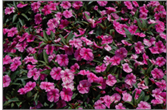
Bounce Pink Flame Impatiens flowers