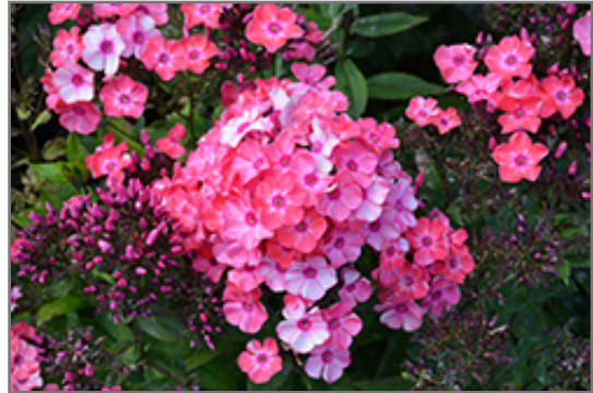
Garden Girls Glamour Girl Garden Phlox flowers

Garden Girls Glamour Girl Garden Phlox is recommended for the following landscape applications;