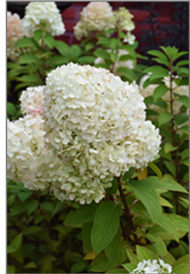
Bobo Hydrangea flowers