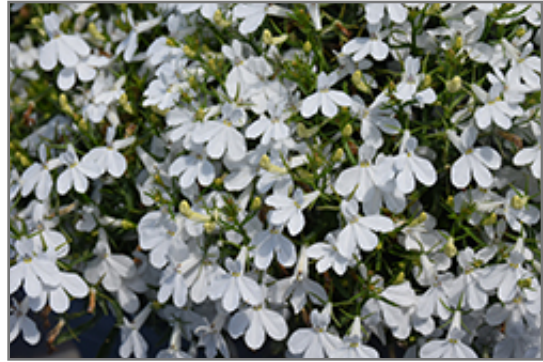
Techno Upright White Lobelia flowers

Techno Upright White Lobelia is recommended for the following landscape applications;