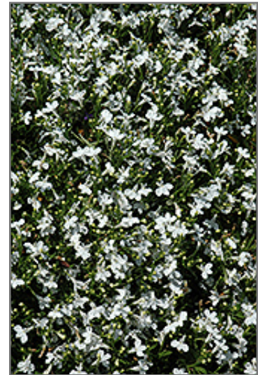
Techno Upright White Lobelia flowers