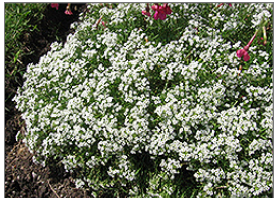
Wonderland White Alyssum in bloom